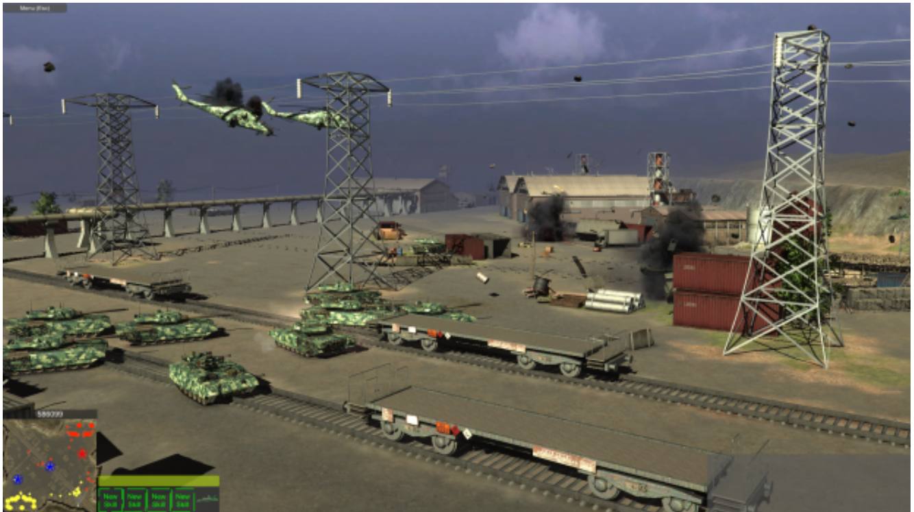
Classic RTS gameplay, with base building and unit training.